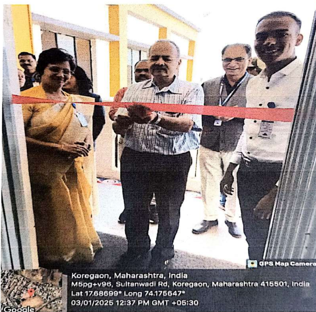
Inauguration of Science Exhibition by Prof.Dr.D.Y.deshpande