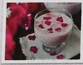
Mohobbat ka sharbat