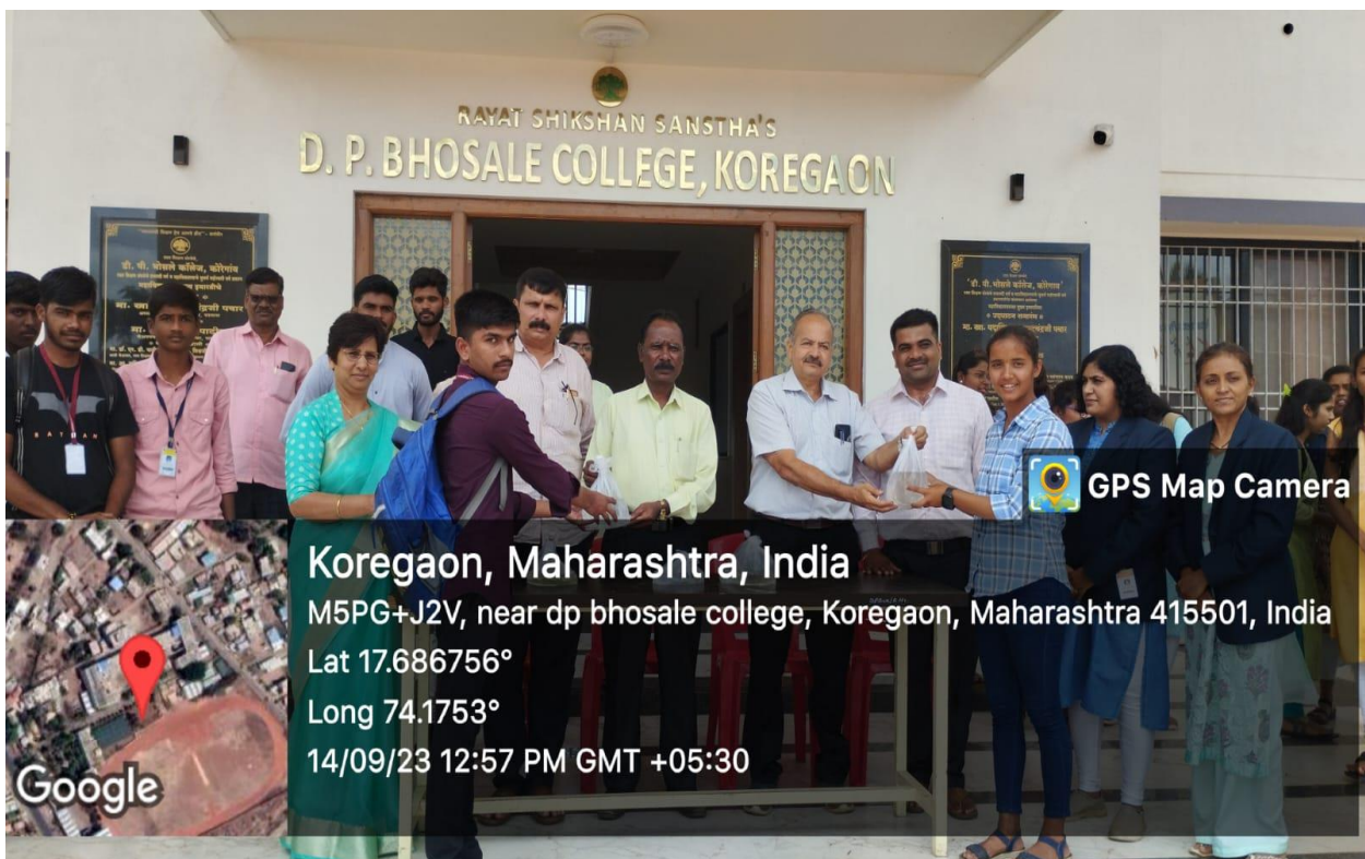
Guppy fish distribution to students

Such initiatives serve as a testament to the commitment of educational institutions and their faculty members in contributing to the well-being of the community. It is hoped that the impact of this event will ripple through the region, leading to a healthier and safer environment for all.