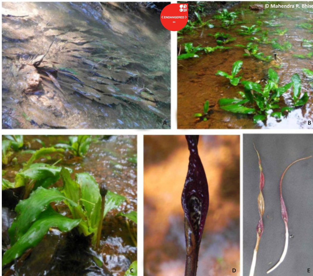
Image 1. A & B - Habit of Cryptocoryne cognata ; C - Fruiting; D & E - Spadix with dark purplish spathes

819. 1908; De Wit, Het Aquarium 31(2): 31. 1960; Patil, Yadav & Dixit, Aqua Planta 17(2): 59-65. 1992.