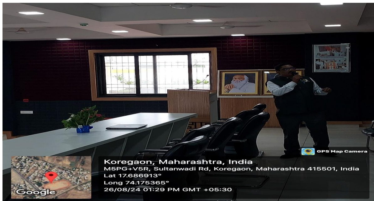
Guidance by the Resource Person