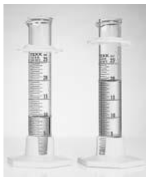
Graduated cylinders containing 0.01 M \text{Cu}(\text{NO}_3)_2 . (a) Cylinder 1 contains 10 mL, or 0.0001 mol, of \text{Cu}^{2+} . (b) Cylinder 2 contains 20 mL, or 0.0002 mol, of \text{Cu}^{2+} .

where n_A is the moles or grams of analyte in the sample, and k is a proportionality constant. Since cylinder 2 contains twice as many moles of \text{Cu}^{2+} as cylinder 1, analyzing the contents of cylinder 2 gives a signal that is twice that of cylinder 1.