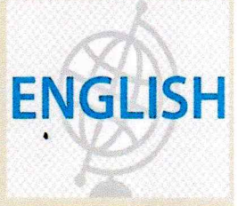
Photo Gallery of Elocution and Essay Competition 2023-24