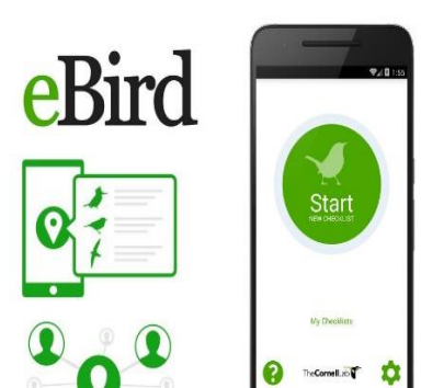
e-Bird App on Mobile