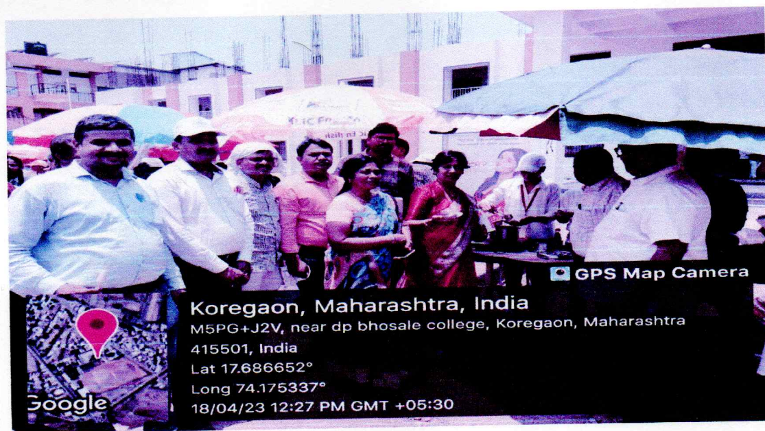
Faculty Visited Food Stalls