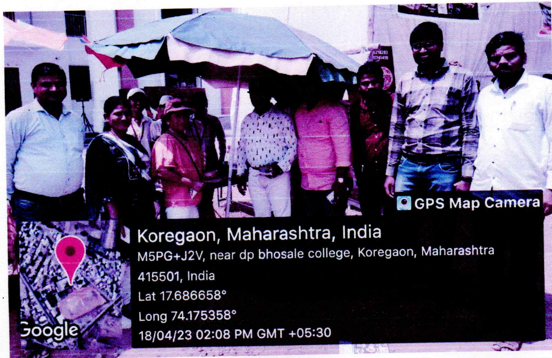
Department of English Installed Stall of Veg Gobi Manchurian