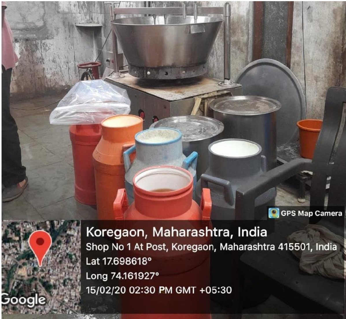
Milk Processing Unit