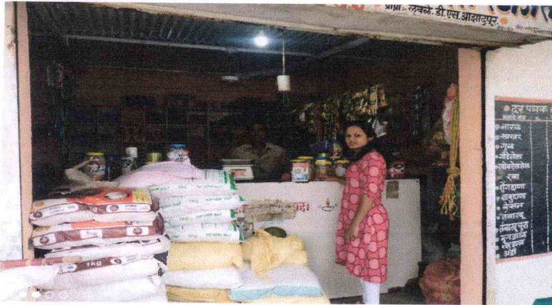
Grocery Shop Village Survey at Azadpur