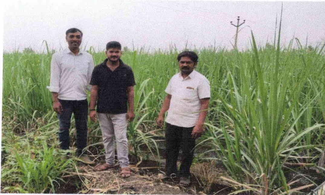
Farmer Survey at Bhose