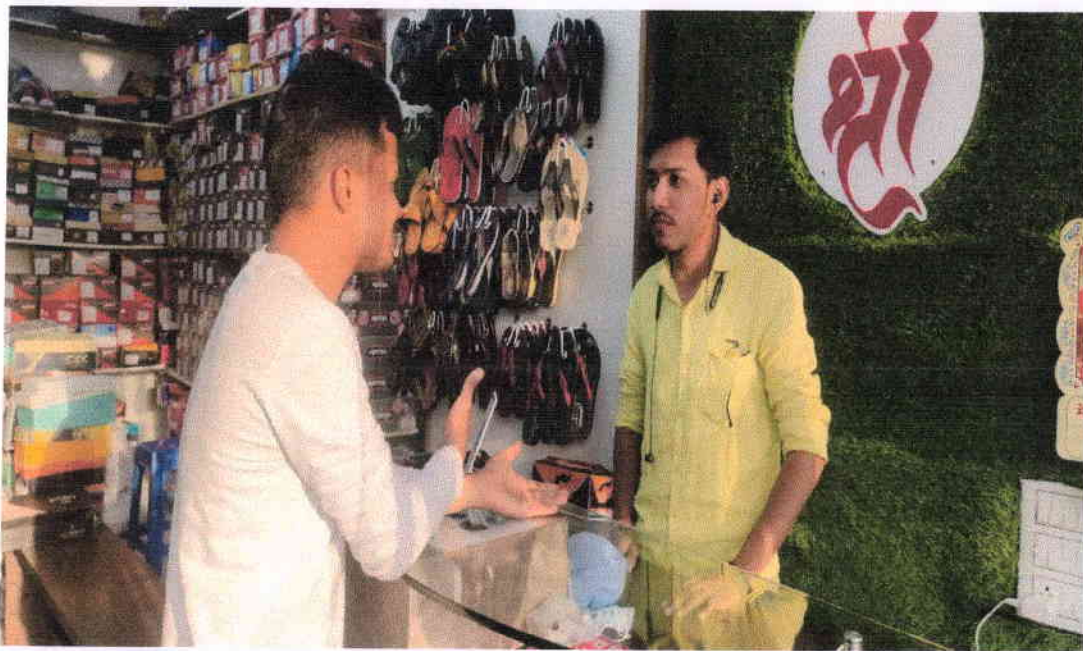
Students Interaction with Foot Wear Owner in Koregaon