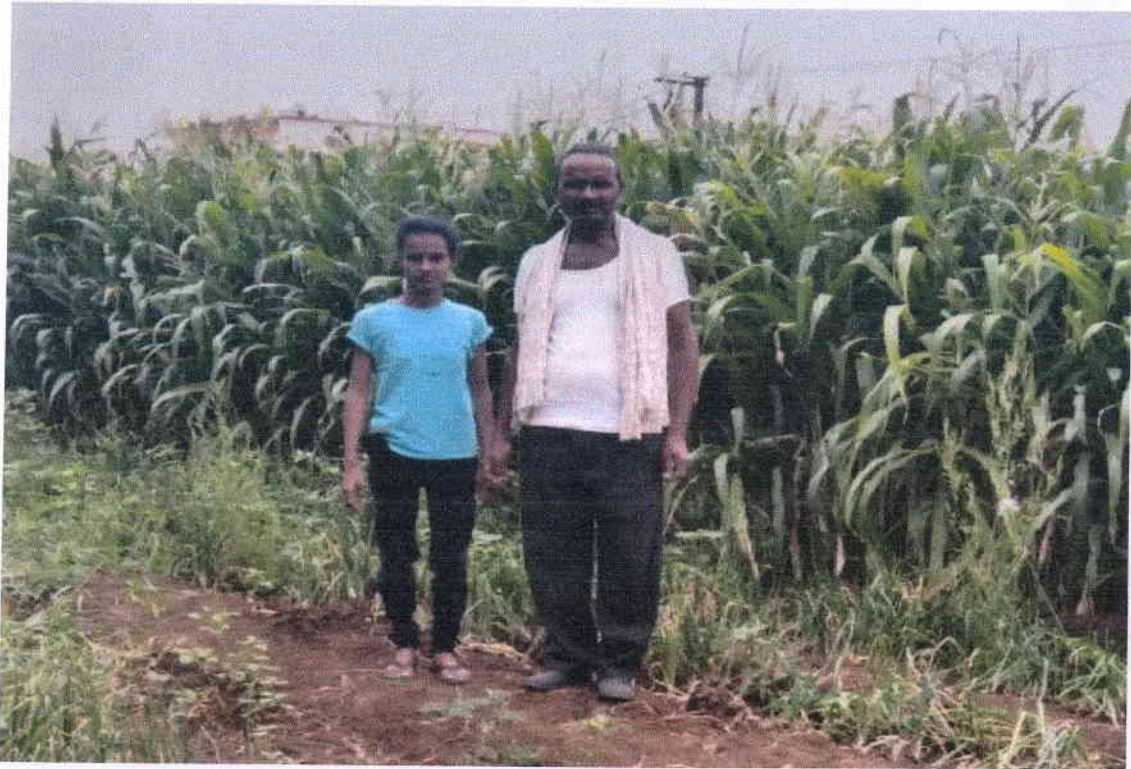
Farmer Survey in Shirambhe