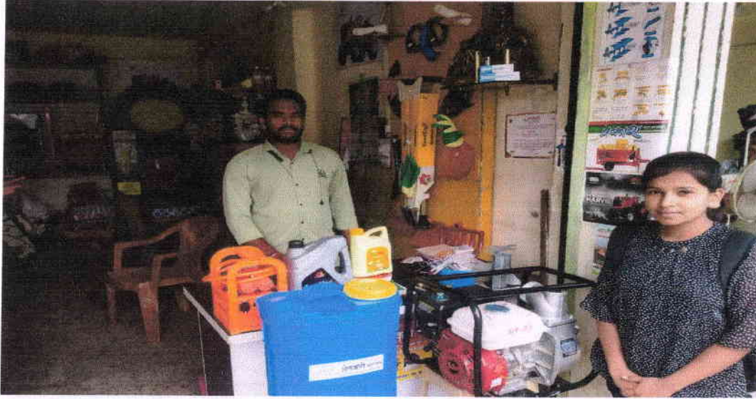
Survey of Farm equipment and hardware owner in Kanherkhed