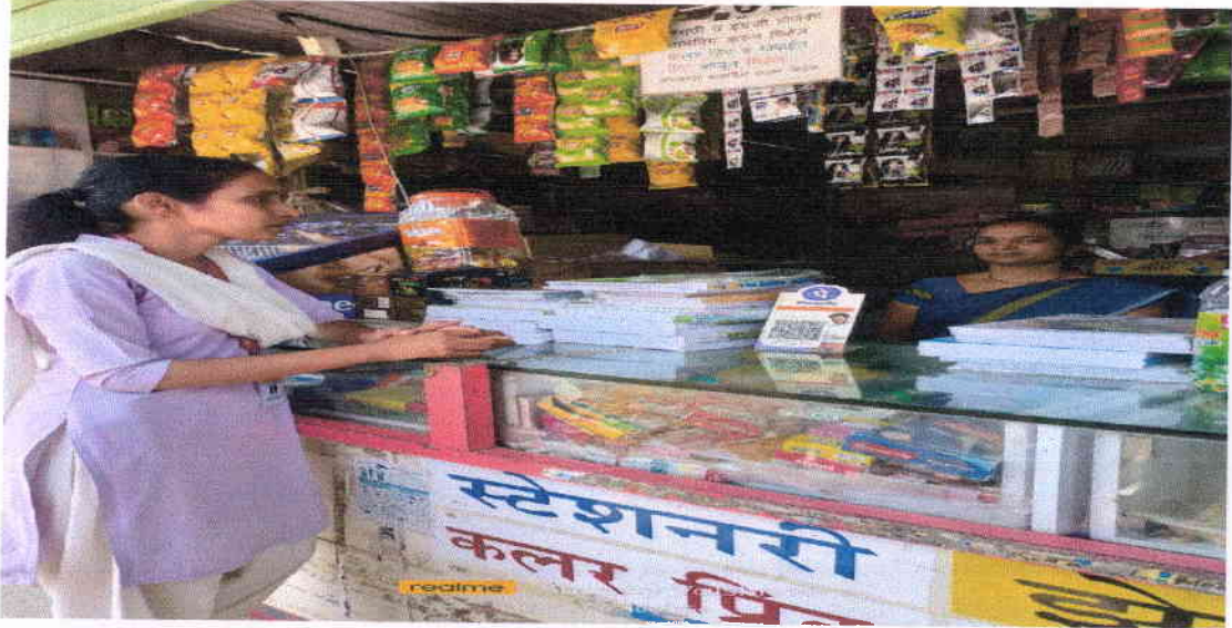
Stationery shop village survey in Kumathe