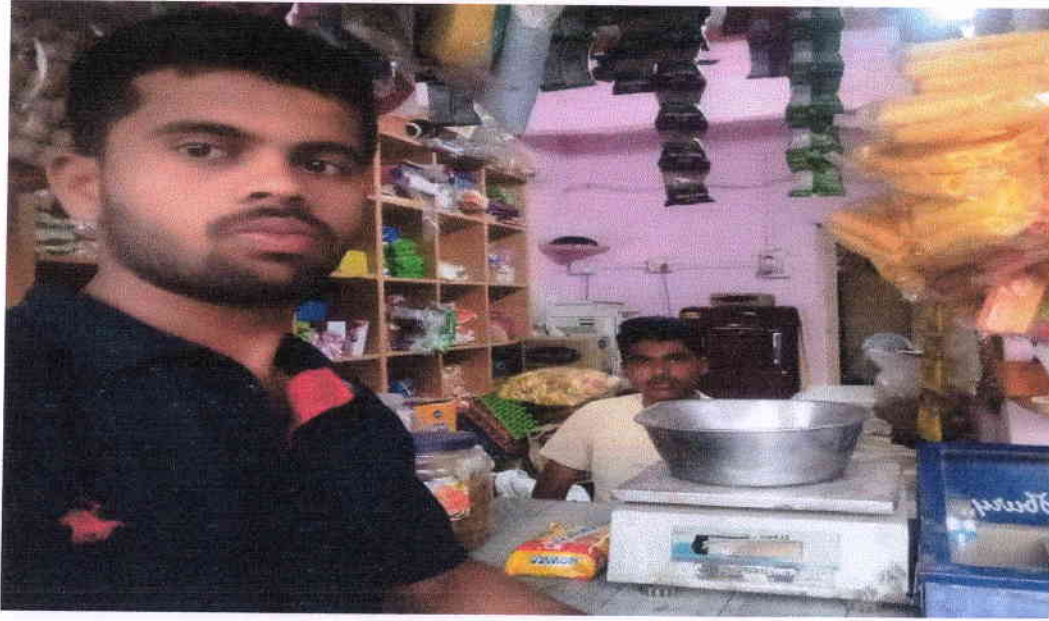
Visit to Grocery Shop at Tadavale