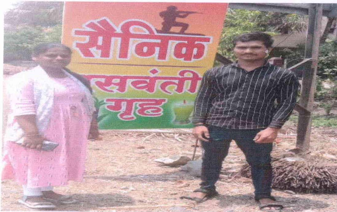
Student visit to Sugar cane juice center at Bhakarwadi