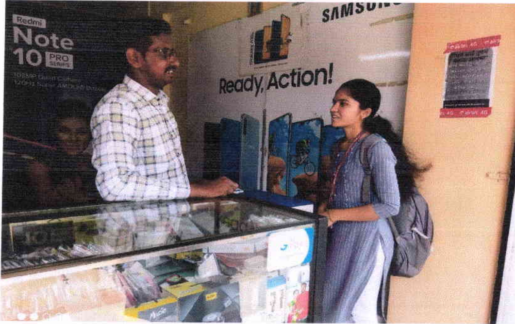
Survey of Mobile shop in Koregaon