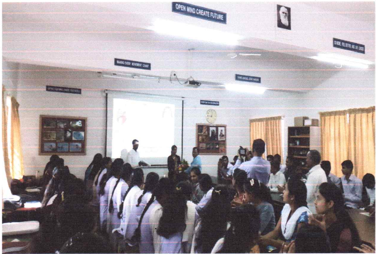
Beneficiary Students B.Sc. II